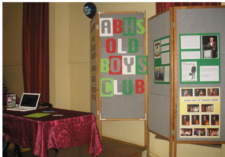
Old Boys Club represented at school Open Night