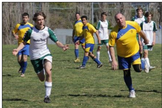
Old Boys Blackwood Shield football