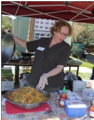
Asian food stall