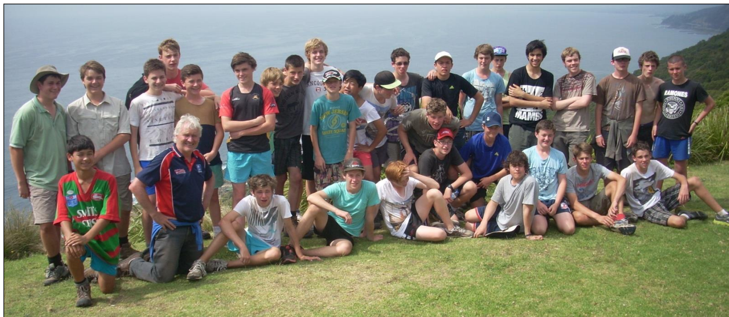
The report accompanying this photo from the Royal National Park Coast Walk, Bronze Expedition, is available on the School's website. Select 'Newsletters' from the Home page, Backchat, March 2013