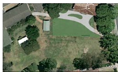
with proposed changes