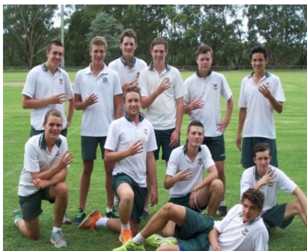
The team after their convincing win against Normanhurst Boys

Well done boys and I am sure that future sides can draw plenty of inspiration from your achievements.