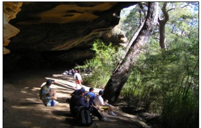
Taking lunch at Pindar Cave during Navigation Training