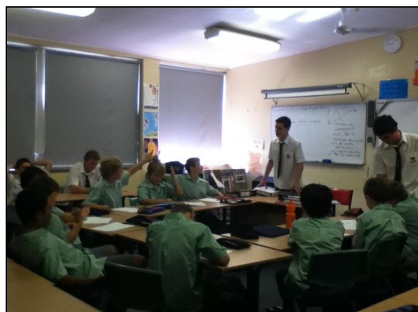
Prefects workshoping with Year 7 students

During the end of year Prefect Camp in 2010, it was decided to review and update the School's Student Code of Conduct.