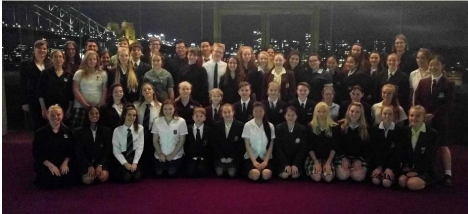
NSW State Choir