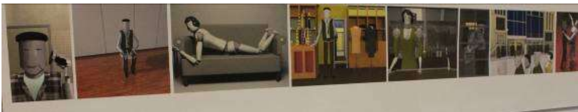
Maximillian Lanzetti " Post Robotic Collins Street 17:00 Hours " Digital Drawing Stanley Aster-Stater " Expressionistic Perceptions Proximos " Painting