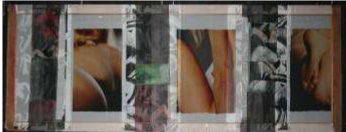
Benjamin Lancaster " Una Esplorazione di Piccoli Bellezza Femminile " ( An Exploration of Subtle Feminine Beauty ) Collection of Works