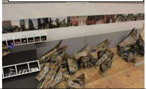
Bren Yema " Mnemonic (Ni - mon - ic) Coexistence " Documented Form