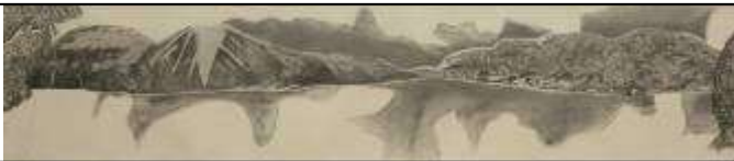
Blake Parbery " Existing on the Nautical edge of the Hawkesbury: Cowan " Drawing